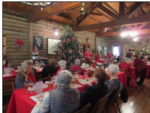
Log House Christmas Luncheon 2013