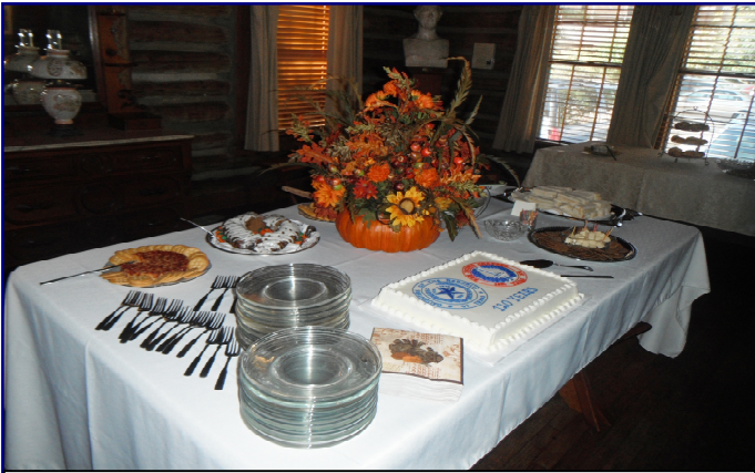
Founders' Celebration Table