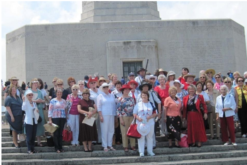
DAUGHTERS OF THE REPUBLIC OF TEXAS CELEBRATING 175 YEARS OF TEXAS INDEPENDENCE