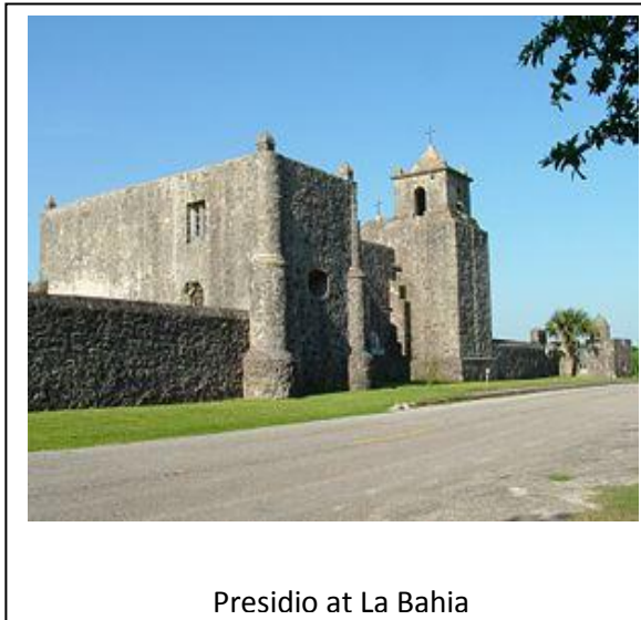
Presidio at La Bahia