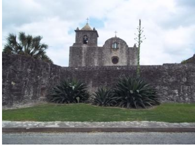
La Bahia Mission