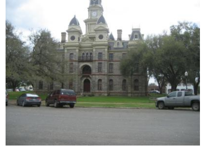
Courthouse on the Square