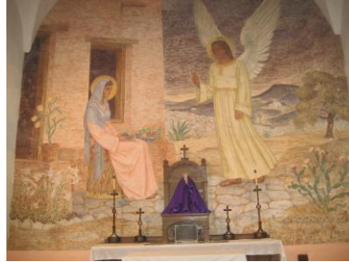
Mural in the Loreto Chapel