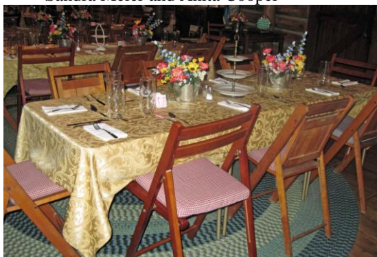
Tables Set for Dinner