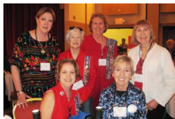
SJC Members Glittered