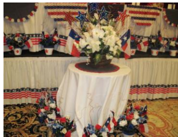
Decorations for Friday luncheon