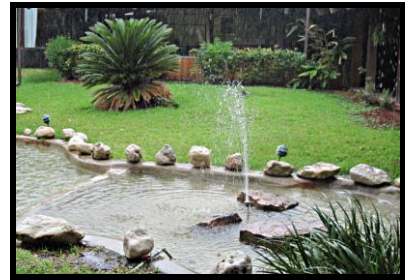
The Water Fountain