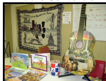
Auction Prizes-Guitar & Afghan