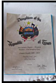
State DRT Award