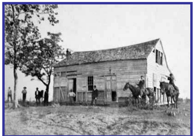
Independence Hall, 1893