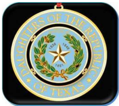
First Edition SJC-DRT Ornament