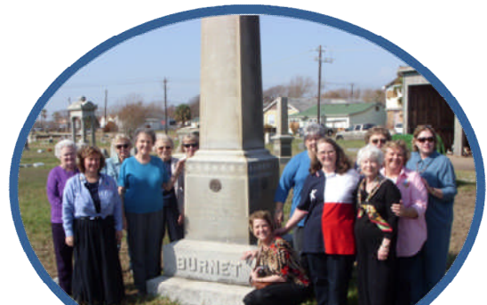
San Jacinto Chapter ladies at the monument to David Burnet...