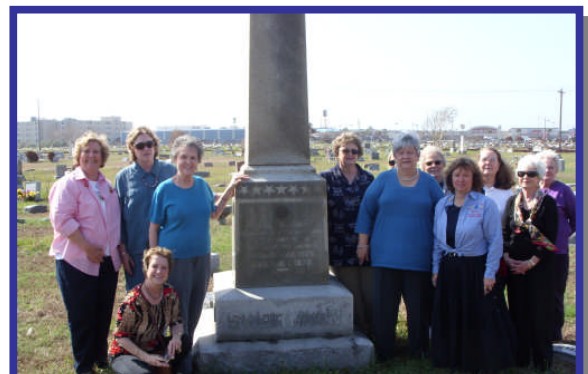
... and to Sidney Sherman – unveiled March 2, 1894. This was the first monument erected by the Daughters of the Republic of Texas.