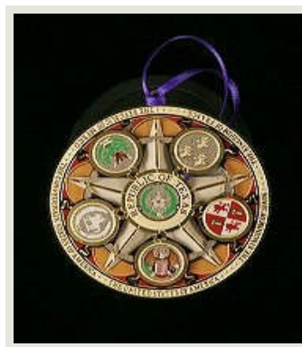
New 2008 Capitol ornament

The state seal crystals are a must have for those people who have everything. Stop by the store; you will find us in our cozy corner.