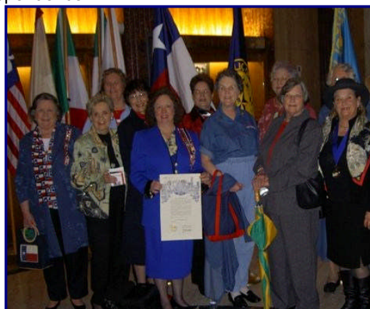
DRT Ladies at City Hall