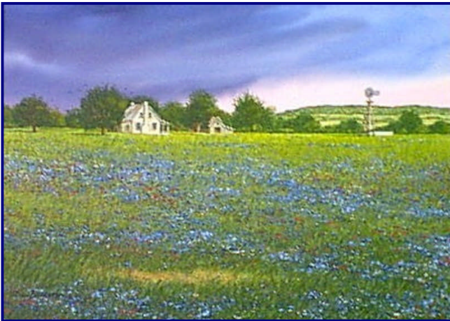
“Texas in Spring” Bluebonnets Gallery

Forms will also be sent in the Daughters Reflections