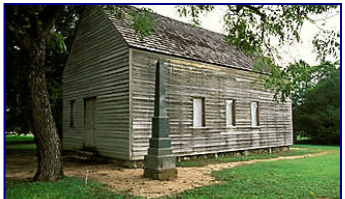
Independence Hall at Washington-on-the Brazos