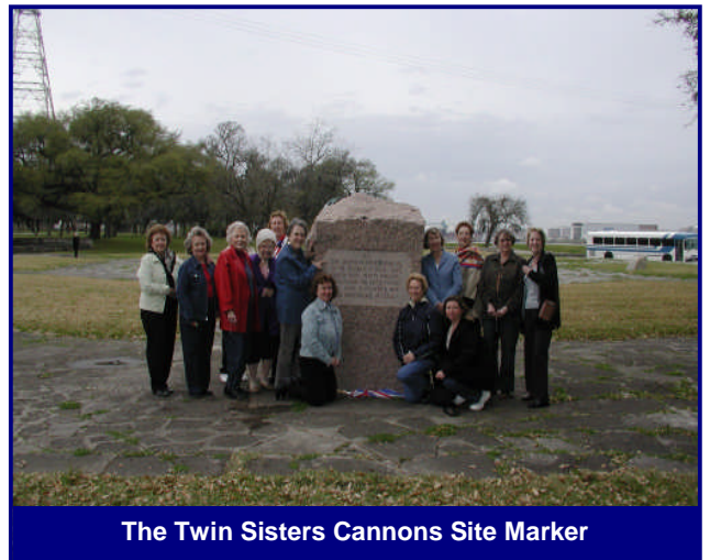
The Twin Sisters Cannons Site Marker