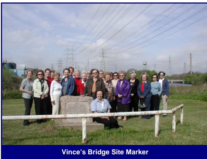
Vince's Bridge Site Marker