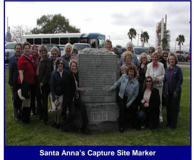
Santa Anna's Capture Site Marker