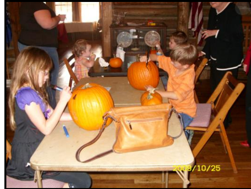
Our CRT—Future Artists