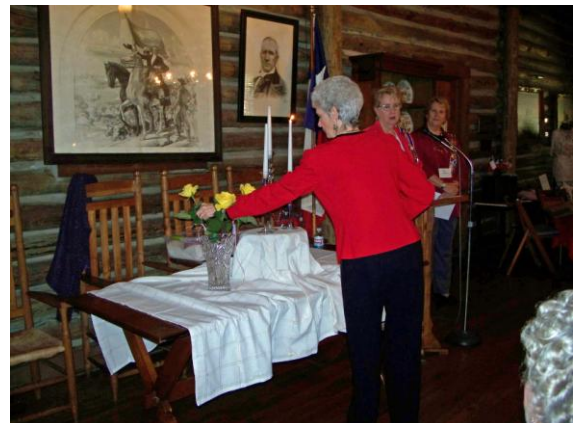
The Yellow Roses