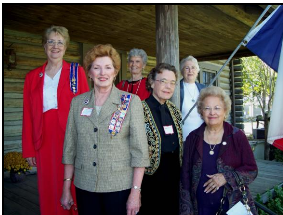
Sidney Sherman Chapter Members