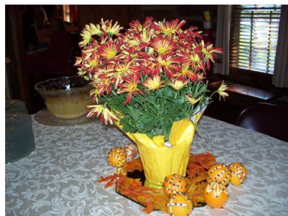
Fall Mums Brighten the Day