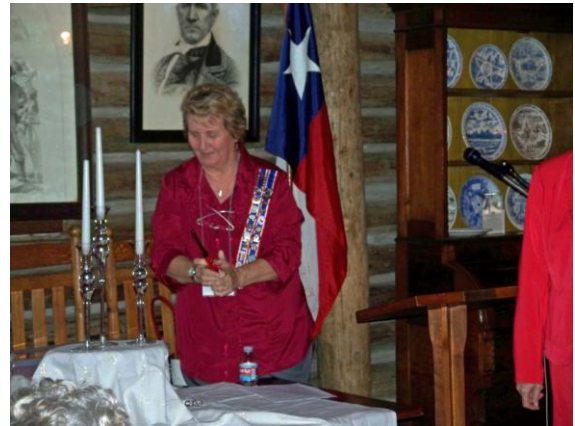
Lighting the Candles