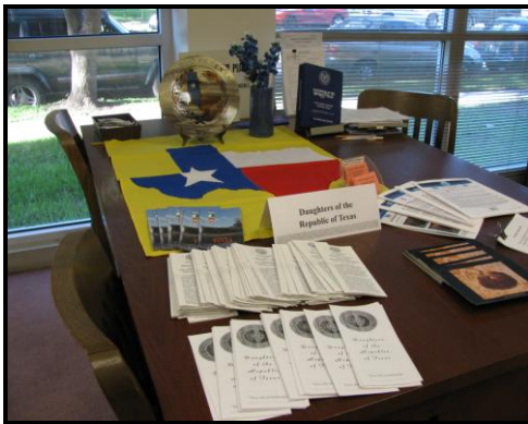
Table at Clayton Library Fair