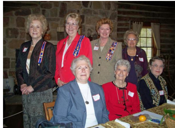
Visitors from Sidney Sherman Chapter