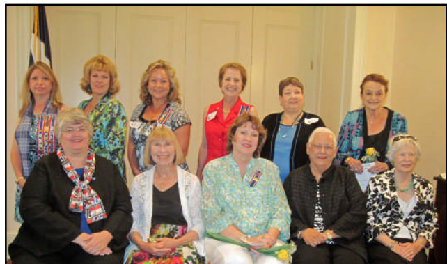
SJC-DRT Officers, 2011-2013