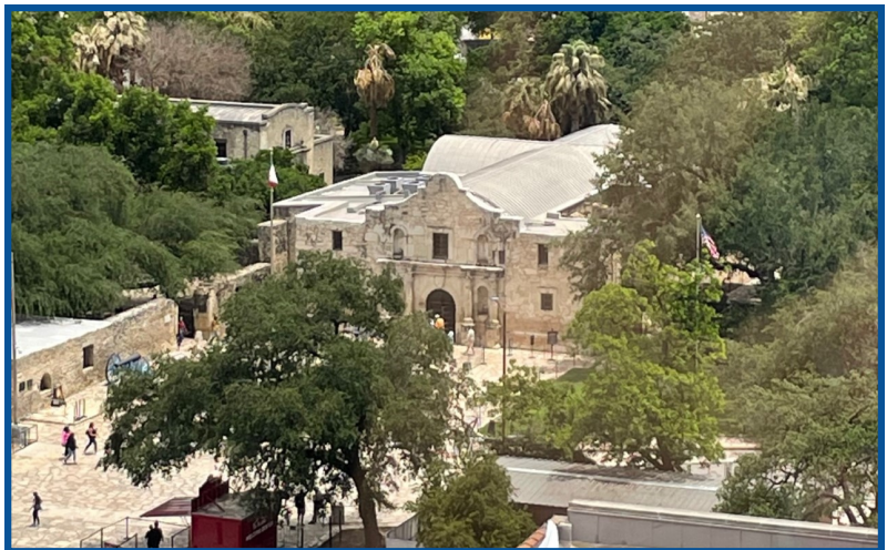
View of the Alamo from the Hyatt hotel