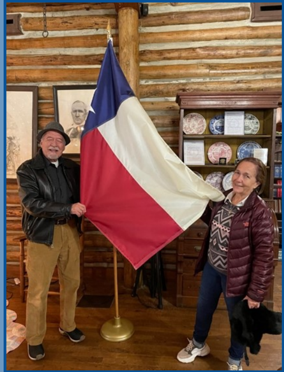
Visitors at our Open House December 17. They are originally from Colombia, S.A.