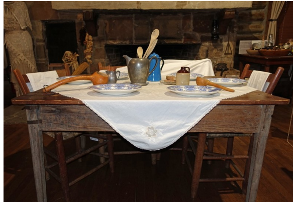
Runaway Table ~ Relic of the Runaway Scrape

Early 1836 was a difficult time in Texas. The Alamo had fallen to Santa Anna who was attempting to take Texas and Mexican Troops seemed to be gathering strength in the South Central portions of Texas. Sam Houston learned of the fall of the Alamo and that Santa Anna was heading towards Gonzalez. Houston decided to retreat east toward the Colorado River as he only had about 400 men in Gonzalez. Sam Houston ordered all of the inhabitants in that area to flee east with him towards safety. Houston's retreat marked the beginning of the Runaway Scrape. Many Texans didn't have time to pack everything up so many hid their furniture and possessions in the forest for fear that the Mexican army would either steal or burn their possessions. It was a gut-wrenching time for these early Texans. Due to lack of planning, many had no means of transportation and were forced to walk. The conditions were grueling; they battled hunger, fatigue, terrible weather and sickness. Many died along their journey. When the Texans finally received word of victory at the Battle of San Jacinto and the surrender of Santa Anna, the Texans turned around and returned to their homes, many of which has been destroyed by the Mexican Army.