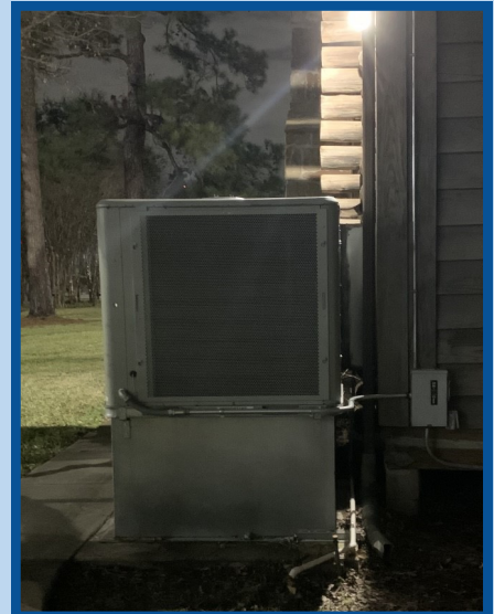
Pictured right: HVAC unit lit by the new security lights. (2022)

Our new security lights at the Pioneer Memorial Log House.