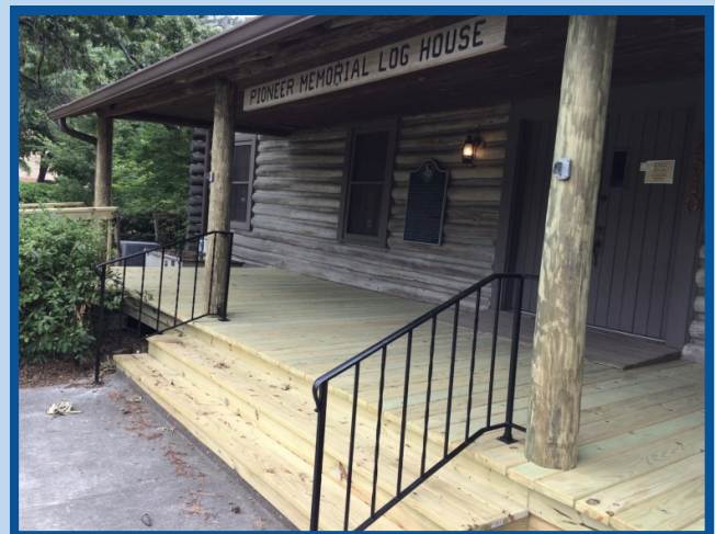
Antique handrails restored and installed on the steps of the new front porch. (2019)