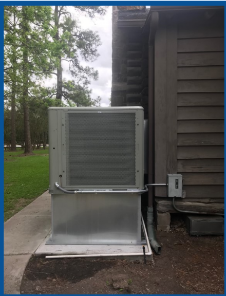
Pictured left: A new HVAC unit with attic vents was installed. (2020)