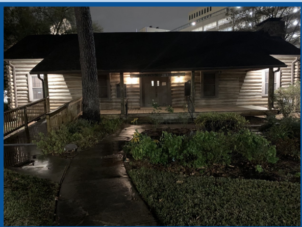
Night shot of the Pioneer Memorial Log House (January 2022)