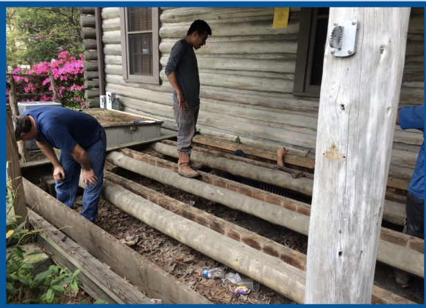
Front porch rebuilt after foundation repairs to the Log House. (2019)