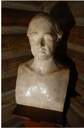
Bust of Sam Houston