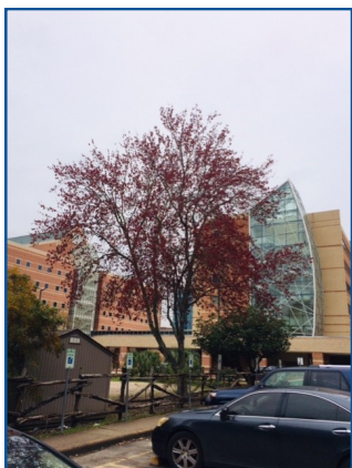
Beautiful Texas Red Maple in bloom at the Log House