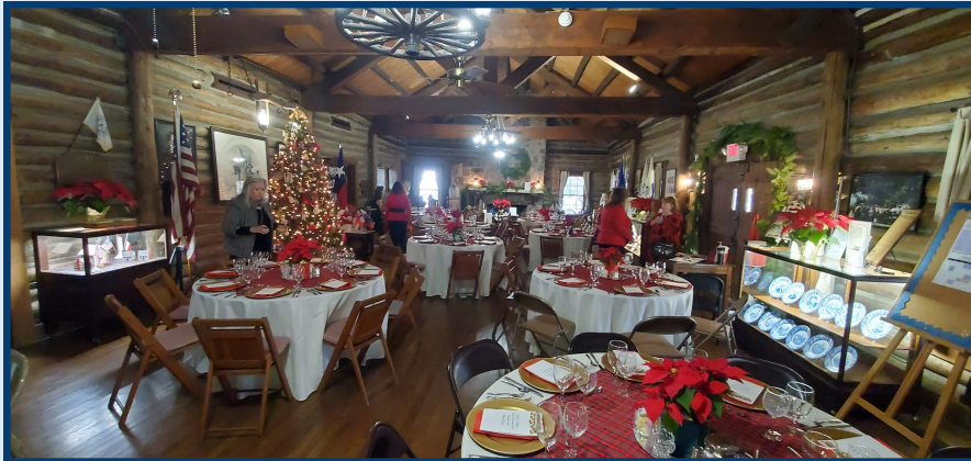
Our beautifully decorated Log House, ready for our December 2nd Holiday Luncheon.