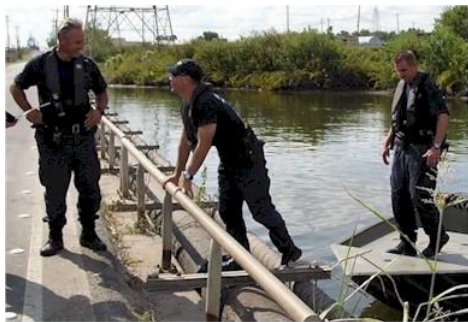
Homeland Security descends upon the RPHS Committee at the Vince's Bridge monument site during Oct. Field Trip.

Vince's Bridge historic site appears to be in secure hands. Sam Houston would be proud!